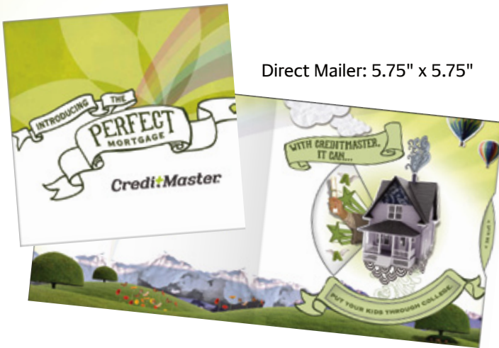
Direct Mailer: 5.75" x 5.75"