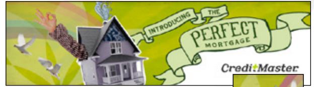
Web Button and Banner